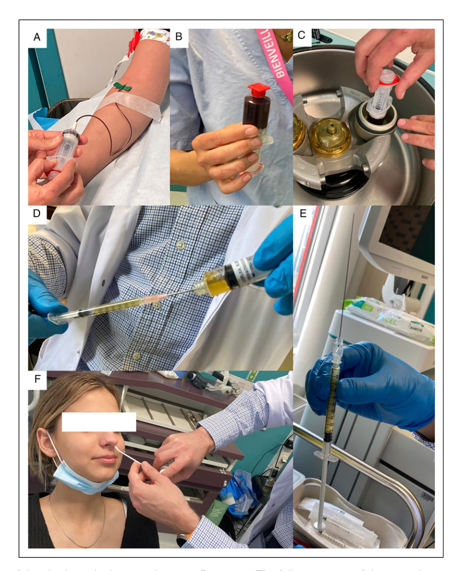
Figure I. Preparation of the platelet-rich plasma and patient. Footnotes: The following steps of the procedure are described: A–B: blood extraction into a tube with sodium citrate anticoagulant; C: centrifugation at 4200 rpm; D: transfer of the PRP into a 1 mL syringe; E: preparation of the 27-G needle for the injection; F: local anesthesia with Xylocain 10% spray 2 minutes after the injection of xylometazoline chlorhydrate drops into the nasal fossae.

the end of the centrifugation because there is a risk to coagulate the supernatant. From an anesthesiologic standpoint, the use of xylocaine 10% spray in place of nasal imbibed packing is sufficient and provides adequate pain outcome during the procedure.